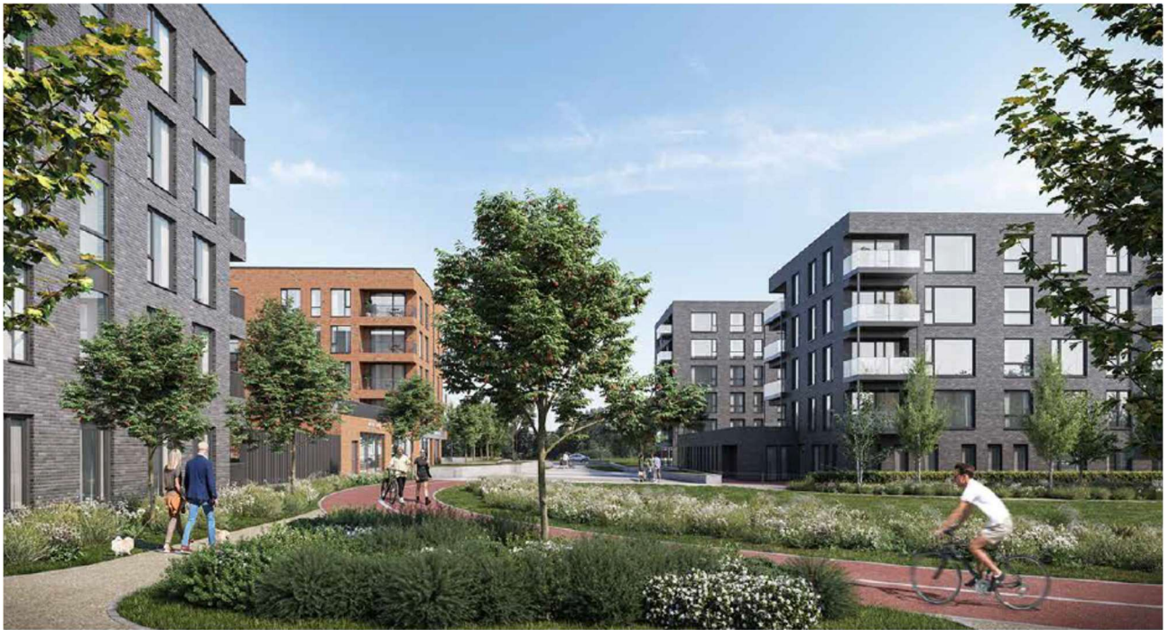
CGI view from Green Link looking west towards Local Centre and Plaza