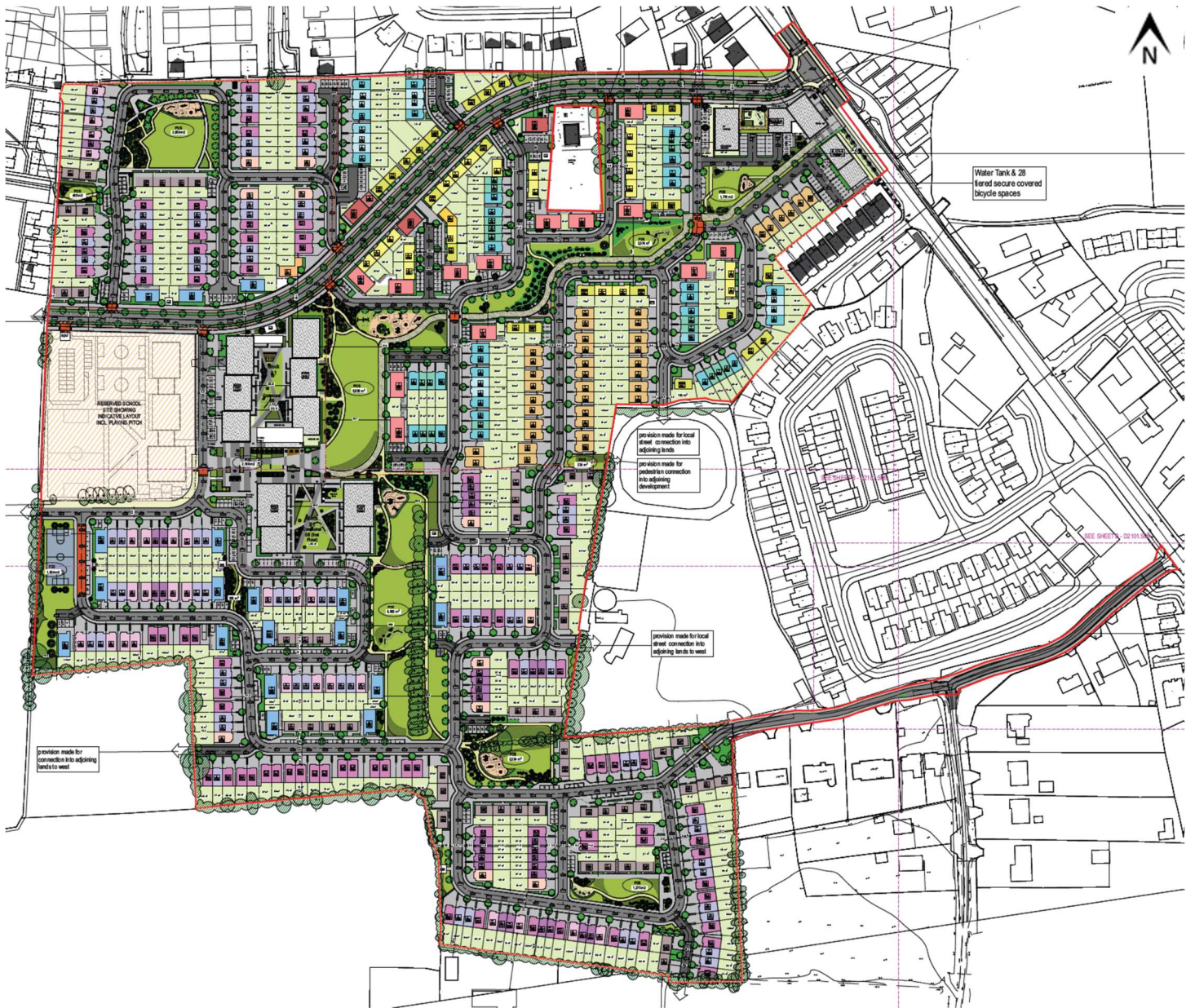
Fig. 8 – Colour coded housing mix dispersed through site layout plan