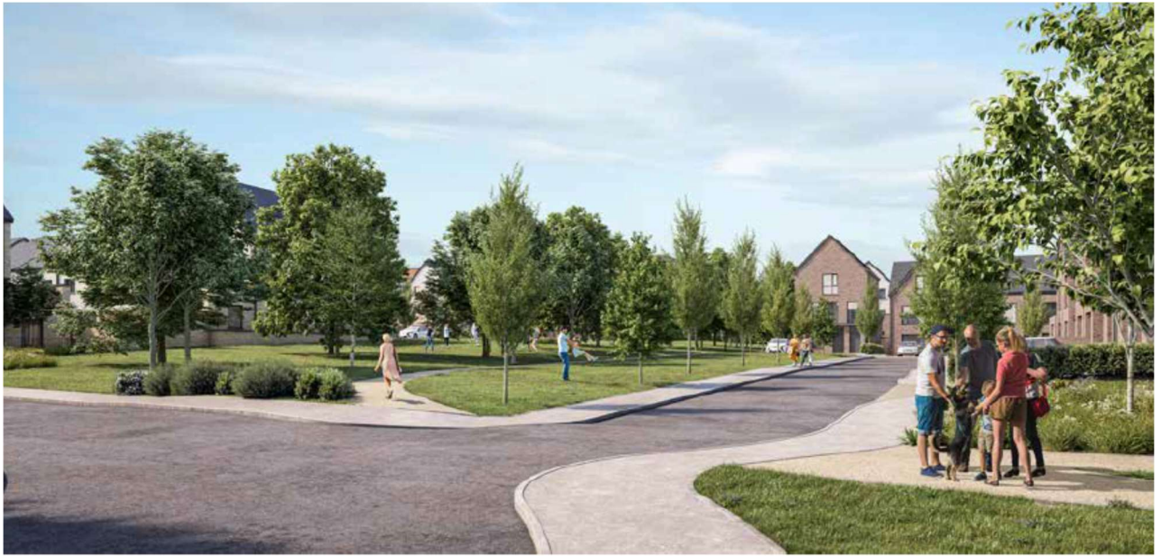
View looking north-west towards open space and in direction of Local Centre