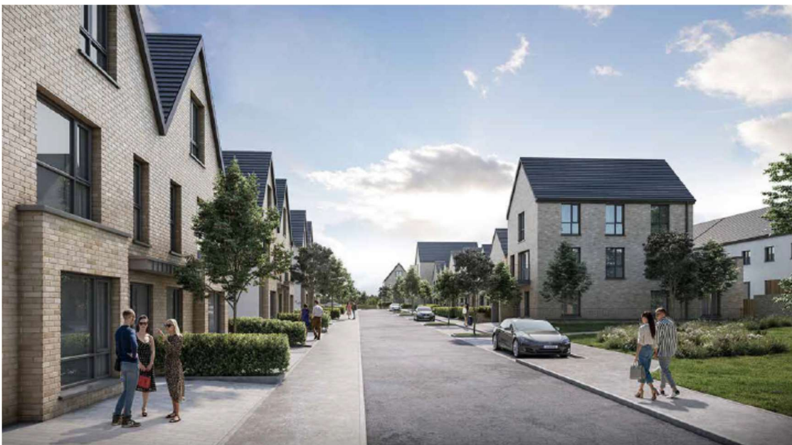
Proposed Housing & Street Typology in South-West Quarter