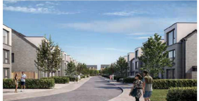
Street view as one moves through the scheme

This area encompasses Aspect’s development area and will form the interface with the Dublin Road. Block A forms a strong urban anchor point at the junction with the Dublin Road and turns the corner along Cherry Lane to address the proposed new link street into the development. Further south along the Dublin Road, a gateway, formed between Blocks A and B, introduces the green link into the development and sets up strong visual connections along the interconnected open space.