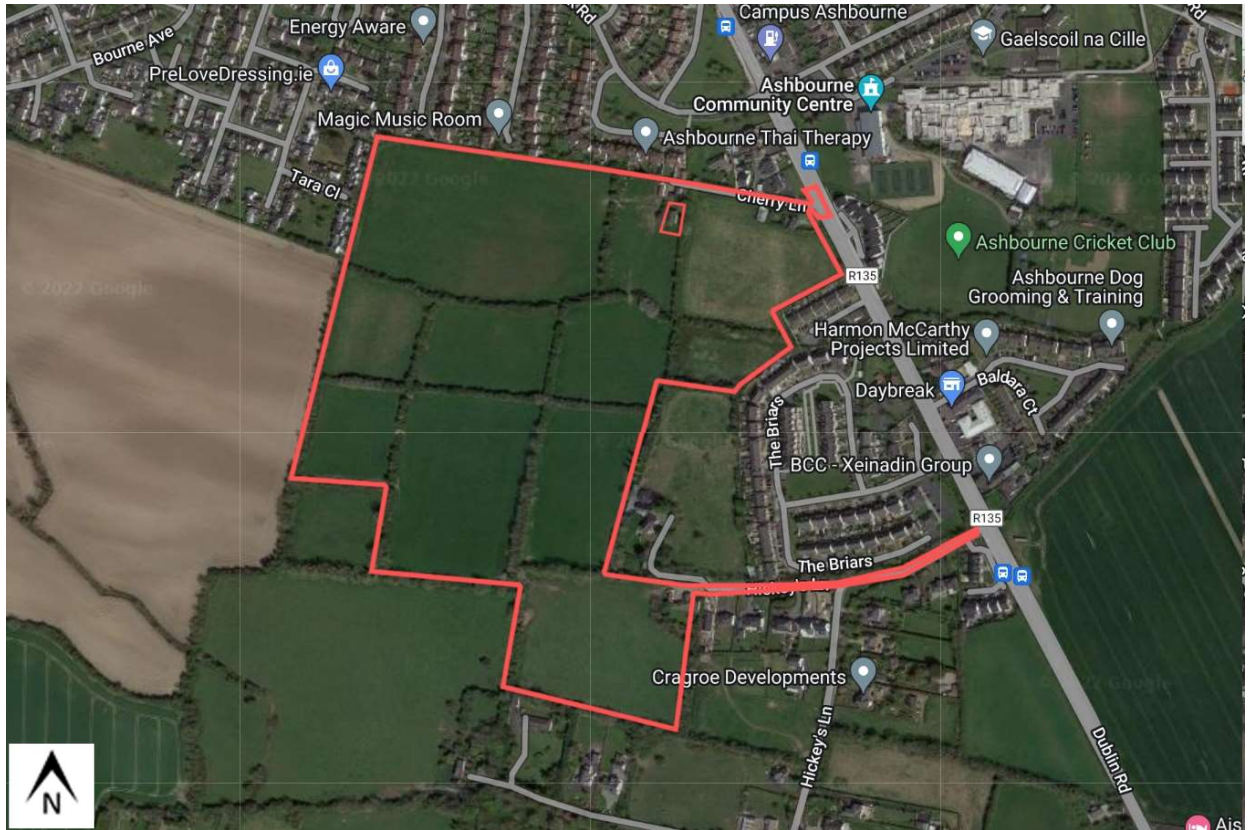
Fig. 2 – Aerial view of subject site, outlined in red