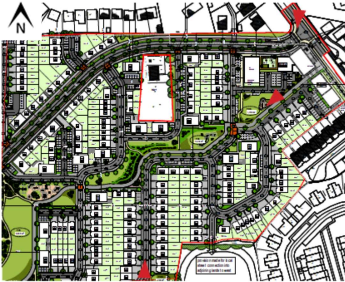
Plan highlighting distinct stepping pattern

This area encompasses Aspect’s development area and will form the interface with the Dublin Road. Block A forms a strong urban anchor point at the junction with the Dublin Road and turns the corner along Cherry Lane to address the proposed new link street into the development. Further south along the Dublin Road, a gateway, formed between Blocks A and B, introduces the green link into the development and sets up strong visual connections along the interconnected open space.