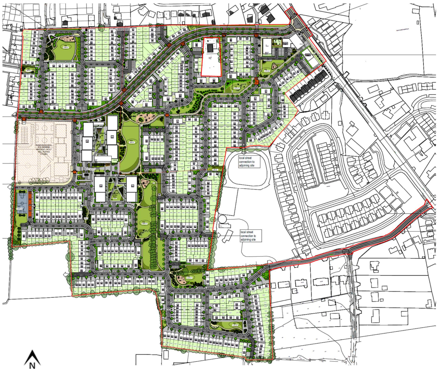
Fig. 5 – Proposed Site Layout Plan

6.3 As can be seen from the enclosed site layout plan, the proposed development responds to its context by proposing a new east-west road (link street) through the northern portion of the site, from Cherry Lane, to create a new street that will, in the future, facilitate access to adjoining lands to the west. Buildings will appropriately address this new street creating a strong street frontage along same. Housing will generally be of a scale comparable with existing housing to the north, east and west. Apartments are proposed to cater for an efficient density of development and variety in dwelling typology, as well as creating definition and focal points throughout the scheme. Throughout the proposed the development is a central necklace of parkland that runs in a general north-south spine through the scheme which, at its western end, will culminate in an urban plaza between Blocks A1 and B1, but is overlooked by buildings along its entire length in order to provide active surveillance.