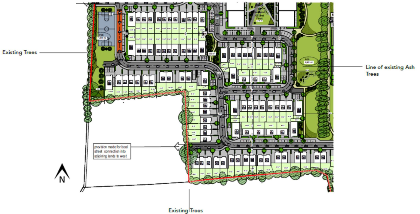
Plan of South-West Quarter

This area contains a large number of existing trees which are to be retained, giving the area a mature and leafy character - the central open space will include a line of native Ash trees and the western and southern boundaries will retain as much of their greenery as possible.