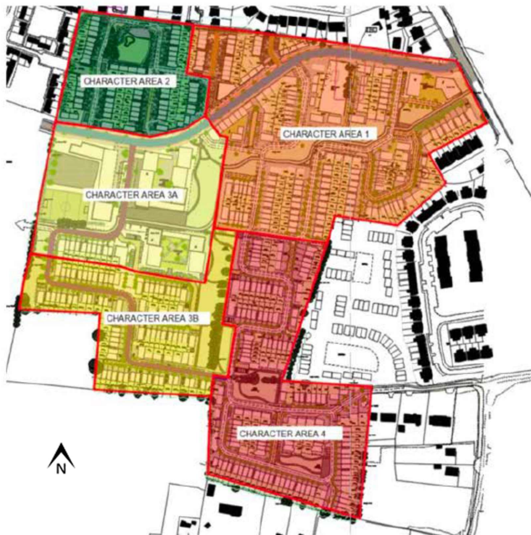
Fig. 6 – Proposed Character Areas within the Development

As set out in the enclosed Architectural Design Statement, the development is divided into five character areas each with a distinct architectural quality. These areas define recognizable neighbourhoods within the overall development which assist in wayfinding and create a sense of place in each instance.