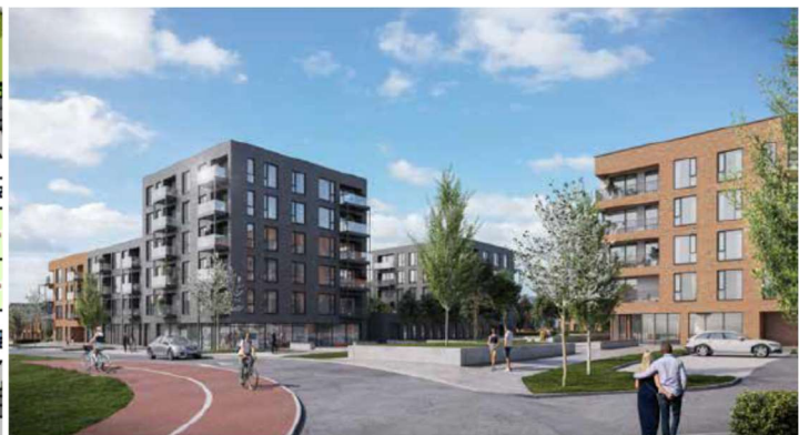
CGI view of Local Centre looking northeast

Plan showing change in the grain of development from CGI view of Local Centre looking northeast houses to apartments & school site