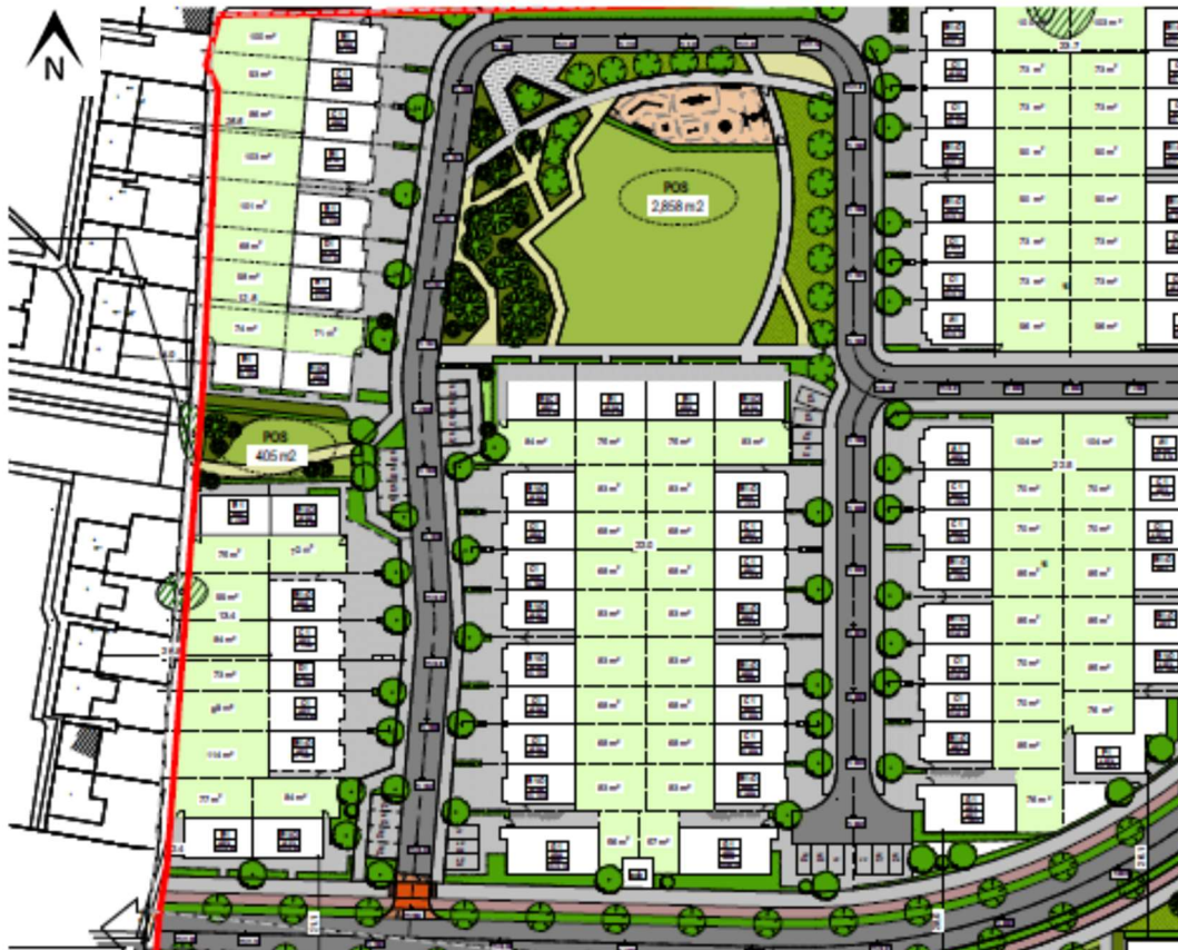
Plan of Character Area 2

This area, which is in Arnub’s landholding, forms the northern edge of the Link Street and will have a strong relationship to the existing developments to the north and west to which new pedestrian linkages may be provided. The area will be further characterized by its distinct square-shaped landscaped open space and associated play area, which is overlooked on three sides by a variety of house types. Dual aspect duplex units or wide frontage gabled units provide frontage to the Link Street to the south. This area will have contrasting unit typologies and material finishes to those within Character Area 1.