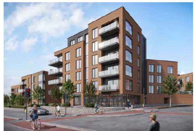
Views of Blocks A & B addressing Dublin Road at entrance to the development