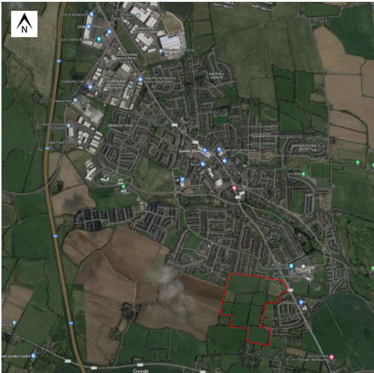
Fig. 4 – Subject site outlined in red in the context of Ashbourne - (Extract from Google Maps)

An Environmental Impact Assessment Report (EIAR) has been prepared in respect of the development proposal and accompanies the application. The application, together with the Environmental Impact Assessment Report, may be inspected, or purchased at a fee not exceeding the reasonable cost of making a copy, during public opening hours at the offices of An Bord Pleanála and Meath County Council. The application may also be inspected online at the following website set up by the applicant: www.ashbourneshd.ie .