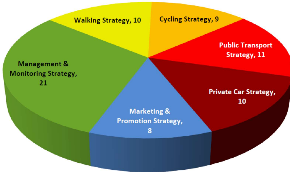
Fig. 9 - MMP Sub Strategy Themes & Initiatives

Please refer to the submitted Mobility Management Plan (MMP) for further details.