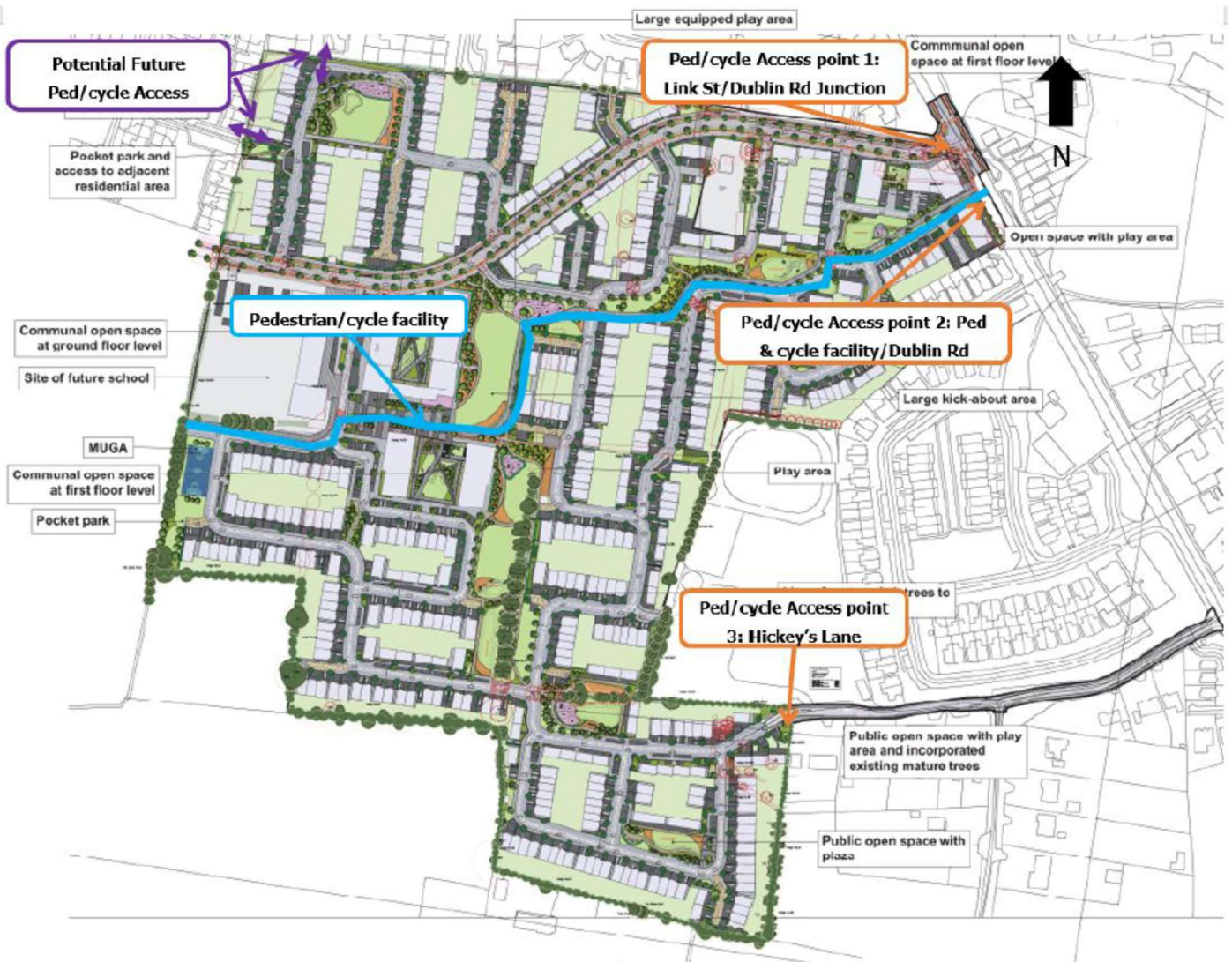
Fig. 7 – Pedestrian & Cyclist Accessibility

Potential pedestrian/cycle connections can be provided into the existing housing estates to the north and west at Alderbrook and Tara Close respectively, if required in the future, to connect to neighbouring lands.