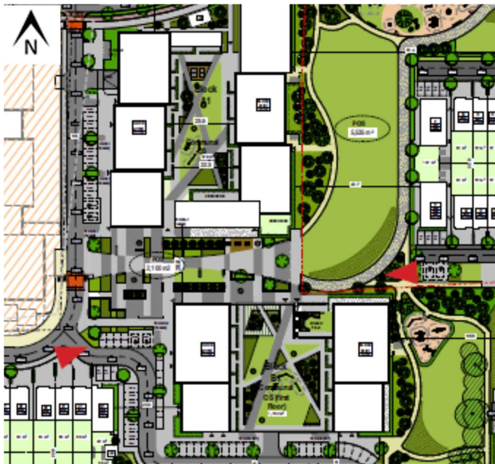
Plan of Character Area 3A

Plan showing change in the grain of development from CGI view of Local Centre looking northeast houses to apartments & school site