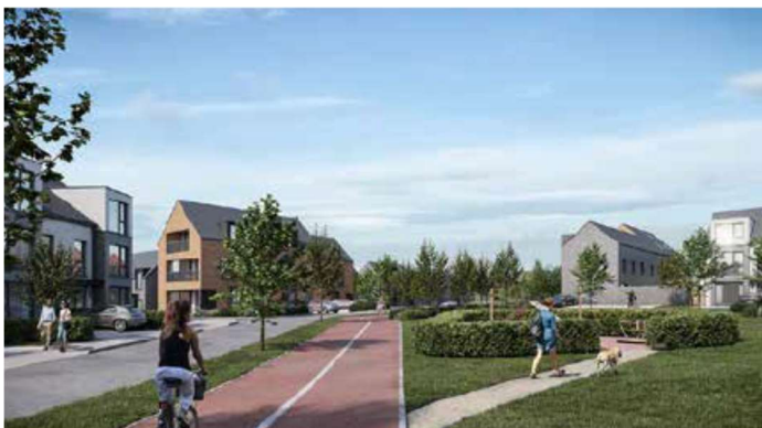
Introduction of green link through the development

This linear open space is typically addressed with 3 storey apartment building (F type) or wide frontage houses (E type). These units are staggered at the end of each urban block to create a distinct stepping movement which invites pedestrians and cyclists further into the development and gives a distinct shape to the open spaces.