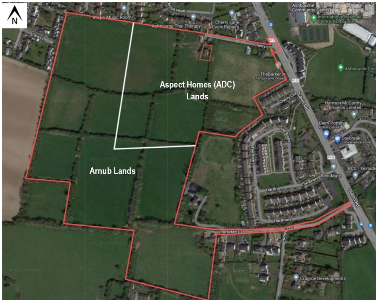
Fig. 1 – Site Location and Land Ownership

Set out further in this report (section 4.2) is the planning history associated with the subject site, however, the applicants have taken on board the previous decision to refuse permission on this site and it is considered that the overall current proposal has been designed in a manner that addresses previous concerns, whilst also taking into consideration the context of the site itself and current planning policy and guidance.